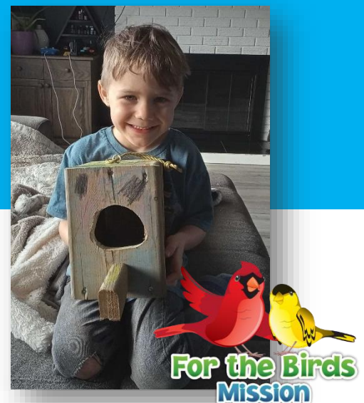
Ranger Dax, BC

To combat pollution around waterbodies, children and families take part in Shoreline Saver help cleanup litter in their local area